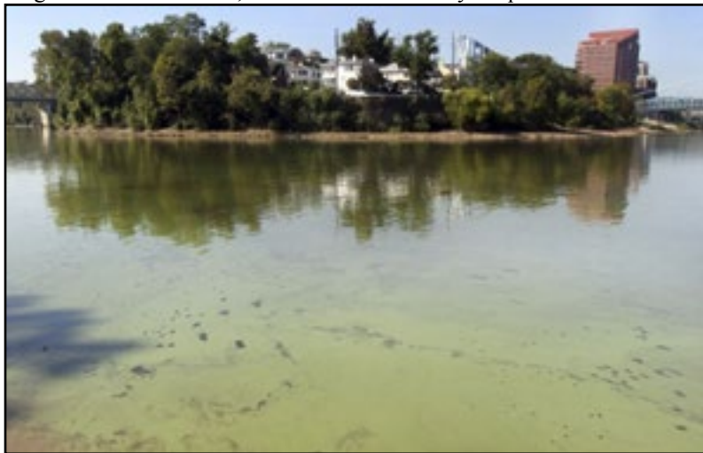
Ohio River algae bloom at the confluence of the Licking River, Oct, 2015