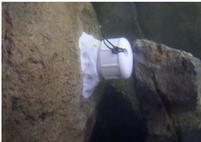
Sensor glued to an underwater rock to record hourly temperatures over extended time periods