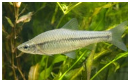
Stone moroko, Pseudorasbora parva, Wikipedia Photo.

A recent threat to European fish diversity was attributed to the association between an intracellular parasite, Sphaerothecum destruens , and a healthy freshwater fish carrier, the invasive Stone moroko Pseudorasbora parva originating from China. The pathogen was found to be responsible for the decline and local extinction of the European endangered cyprinid Leucaspis delineatus and high mortalities in stocks of Chinook and Atlantic salmon in the USA. The emerging S. destruens is also a threat to a wider range of freshwater fish than originally suspected such as bream, common carp, and roach. This pathogen is a true generalist as an analysis of susceptible hosts shows that S. destruens is not limited to a phylogenetically narrow host spectrum. This disease agent is a threat to fish biodiversity as it can amplify within multiple hosts and cause high mortalities.