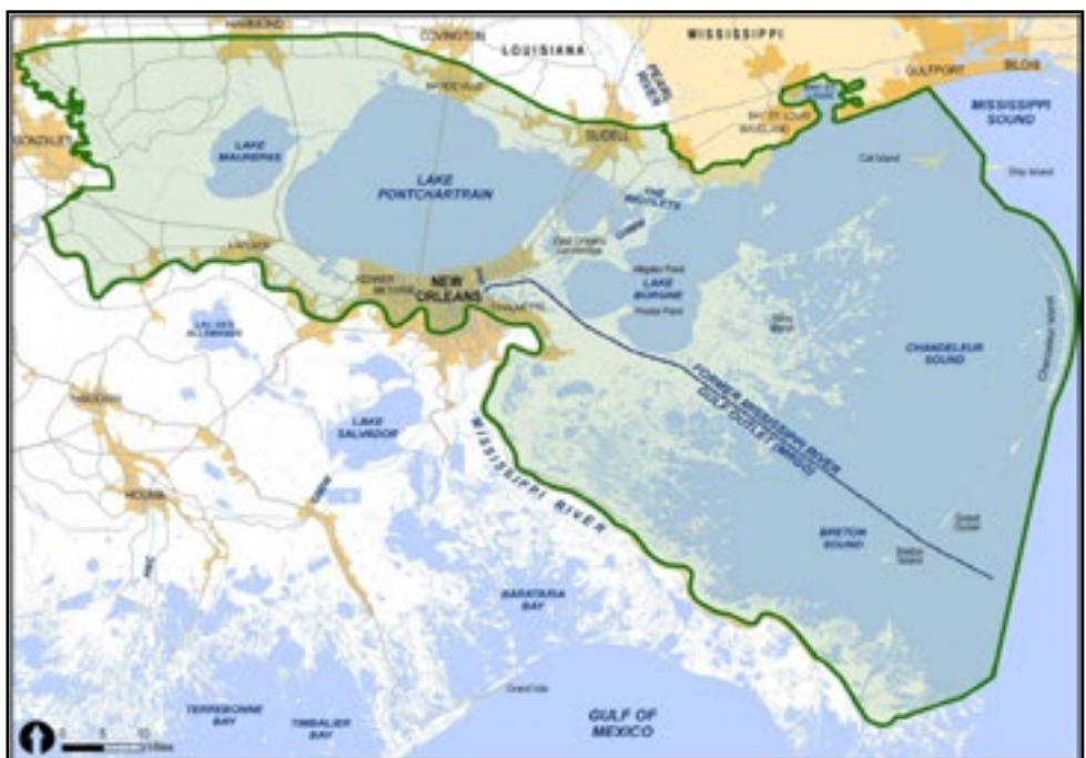
Map of the lower Mississippi River and Mississippi River - Gulf Outlet (MR-GO)